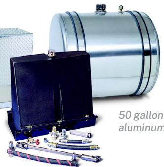
50 gallon aluminum round