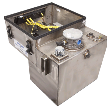
Stainless steel reservoir/enclosure combo